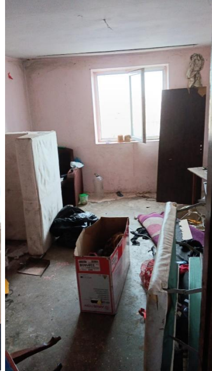
The room orphan children live