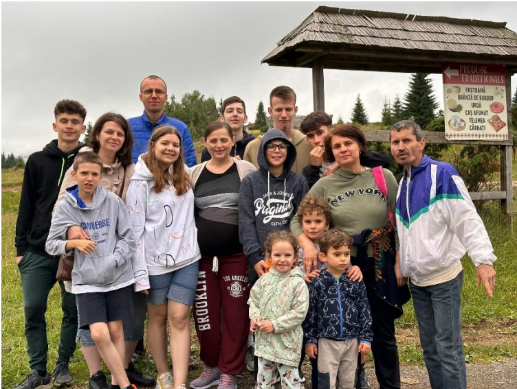
Four days together with 2 other families of believers